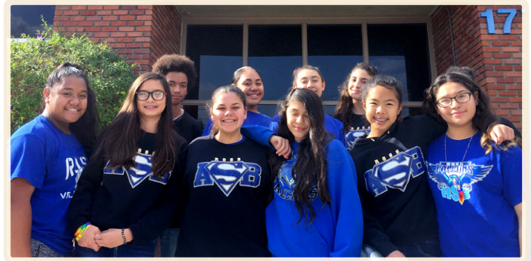
Ross MS Academy Associated Student Body Students