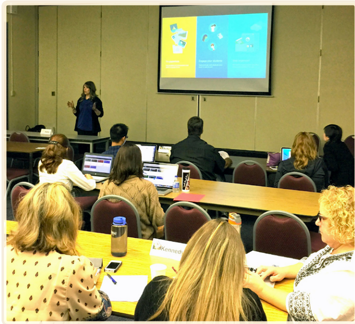
Window 2 Schools' Teacher Leaders attending a Tech Camp designed specifically to support their role as a site leader in technology.

Nineteen ABC schools have initiated their Technology Integration Projects on their campuses. In February 2016, the remaining ABC schools will come on board. Each TIP school has selected specific grade level(s) or department team(s) to transform their classrooms into models of 21 st Century teaching and learning. TIP classrooms use 1:1 classroom technology on a daily basis, create standards based technology infused lessons, and a commitment to professional development throughout the year. As a result of a tight supply of available substitutes, the TIP program is shifting a portion of its planned professional development from substitute based release time, to after school hourly. The TIP program requires school TIP teams to plan and collaborate together to enable a powerful synergistic forward momentum to be created among each school TIP team. The shift to hourly TIP team collaboration time will augment the opportunity each school team has to work together.