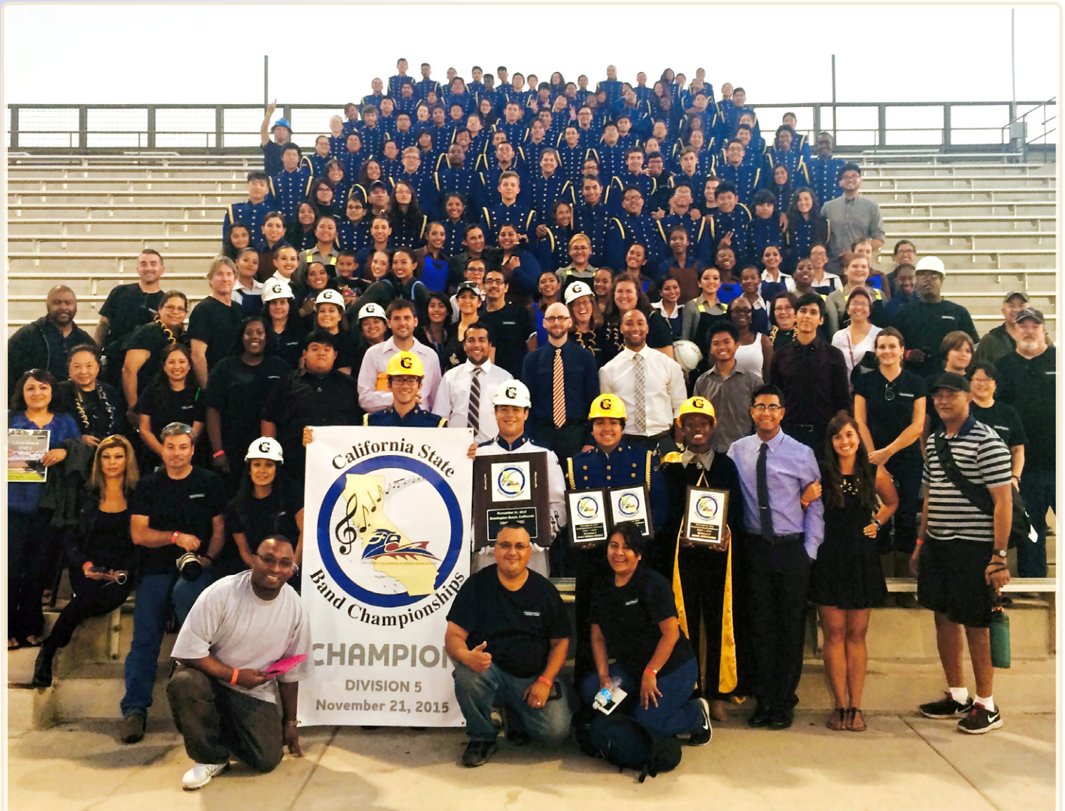
Gahr HS Marching Band selected by the Southern California Judging Association (SCJA) as the 2015 California State Band Grand Champions.