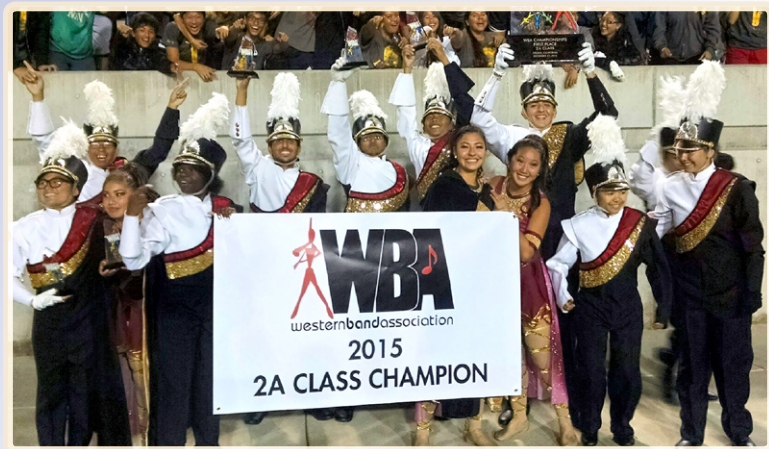
Cerritos HS Regiment of Gold 2015 Class 1A/2A/3A/ Grand State Champions

On Saturday, November 21, 2015, Cerritos HS "Regiment of Gold" Marching Band competed in the 2015 WBA State Marching Band Championships with their production "Conquer." After enjoying an undefeated season, the CHS "Regiment of Gold" Marching Band was crowned the 2015 Class 1A/2A/3A Grand State Champions. Cerritos HS has been able to hold this title for three years now. Besides winning the Class 2A Title, CHS swept all caption awards which included High General Effect, High Music, High Visual, High Auxiliary, and High Percussion. ▶