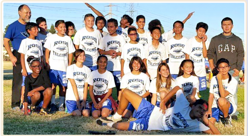
Ross MS Academy Cross Country Team